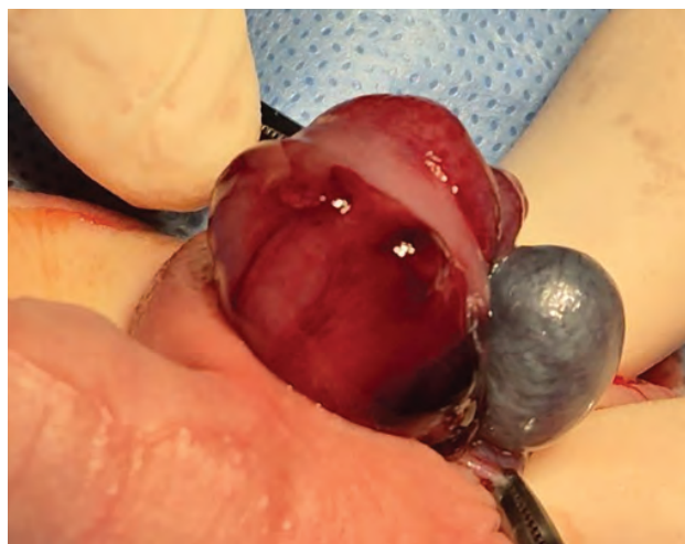
Fig. 1. Intraoperative appearance of the sigmoid colon and testis.

Urgently, about 28 hours after the onset of symptoms, the child was taken to surgery with an incision in the left hemiscrotal region. On exploration, a small amount of serous fluid was found. To avoid inadvertent injury to the bowel, the pouch was opened and a loop of sigmoid colon identified by haustration and mesocolon was found to be present. The sigmoid colon was viable with moderate edematous changes. The testis had obvious ischemic changes (Fig. 1). With gentle but difficult manipulation, it was possible to reduce the sigmoid colon into the peritoneal cavity after observing restoration of vascularization of the preserved testis.