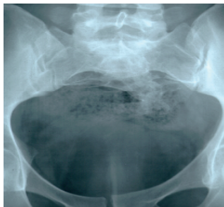
Absence of the right half of the sacrum