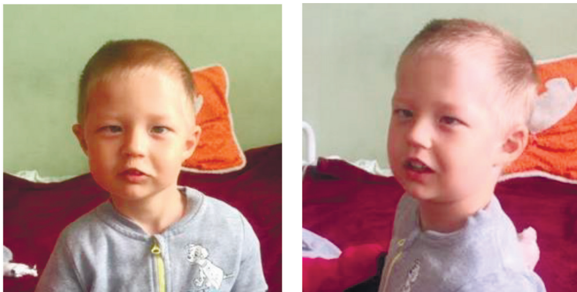
Figure 1. A child with Zhu-Tokita-Takenouchi-Kim syndrome (parental consent was obtained for the publication of the photo).

Neurological status - the child is in conscious, responds calmly to the examination, perform individual instructions. He could repeats a few words, but spontaneous speech is absent. The head is macrocephalic, the circumference of the head is 48.5 cm. Convergent braid is more on the right. Muscle tone is reduced D=S, mainly in the lower limbs. Tendon reflexes from the upper limbs are evoked by D=S, alive. Knee reflexes are not evoked, D=S. Independent walking. Babinski's symptom is negative D=S. There were no sensitivity disorders. There were no meningeal symptoms.